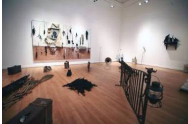
Radcliffe Bailey, In the Returnal , 2007, photograph, acrylic, plant material, wax, Georgia red clay, glitter, oil stick on wood, found objects; painting: 72 x 120 inches, found objects - sizes vary © Radcliffe Bailey